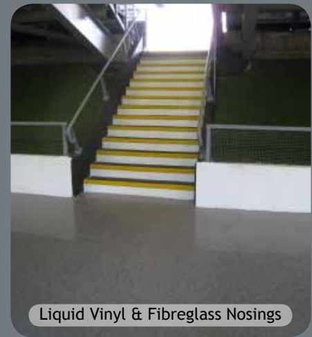
Liquid Vinyl & Fibreglass Nosings

Craven Cottage is the name of a sports stadium in the Hammersmith and Fulham area that has been the home ground of the association football team Fulham F.C. since 1896. The Stadium is located next to Bishops Park on the banks of the River Thames.